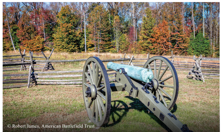
The battle at Gaines' Mill witnessed over 15,000 combined casualties in six hours of fighting, and ended with Lee's first victory as commander of the Army of Northern Virginia.