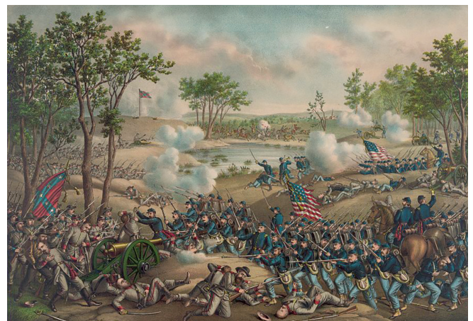
The Battle of Cold Harbor was fought, in part, on the 1.2 acres of hallowed ground that need preserving.