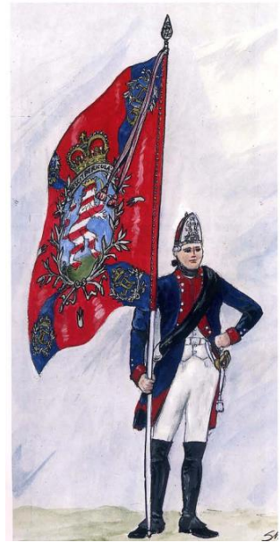
Figure 1 “Leibfahne of Regiment Erbprinz. As noted in text, it is not entirely clear whether small crowns and cyphers were always gold or followed the color of the uniform metal. It seems reasonable that the spear point would be silver or gold to match the regimental metal in buttons and cap plate.

In the American Revolution, the Hessians were a professional band of German auxiliaries who arrived to quash the rebellion. They were leased out from their home region of Hesse-Kassel—now part of modern Germany—and used by Britain to augment their small standing army. In 1776, 18,000 Hessian troops were sent to Staten Island . During the war, 5,000 were killed or injured, and 3,000 stayed in the United States after the war’s end. Because of their circumstances as being rented by Britain, the Hessians were viewed as violent mercenaries who were willing to fight for the highest bidder.